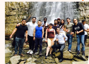
... travelling to beautiful places