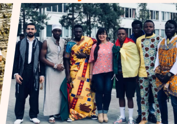
... sharing knowledge about native countries